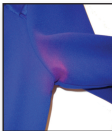
The underarm area of this blouse was discolored by perspiration.

Damage due to consumer use or storage is often not apparent until after cleaning. Many staining substances are invisible when they dry, but they oxidize, darken, and therefore become visible when exposed to heat in cleaning and pressing. Likewise, several staining substances, such as alcoholic beverages, perfumes, or household cleaning products, contain chemicals that contribute to color loss.